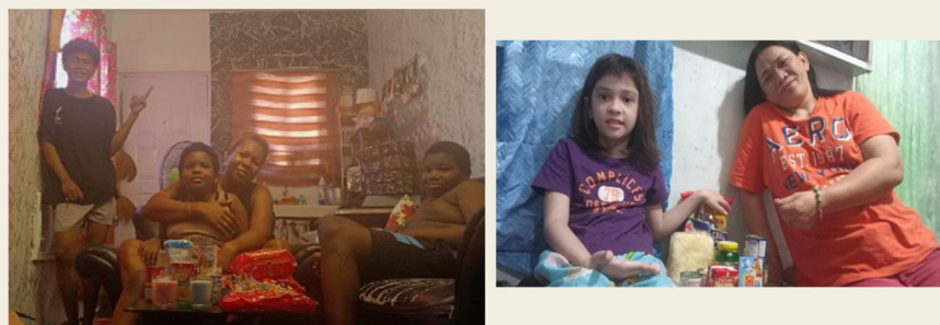
Families from Cavite and Rizal Areas