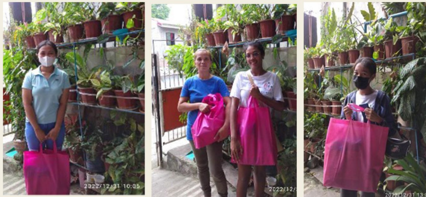
Bulacan based beneficiaries