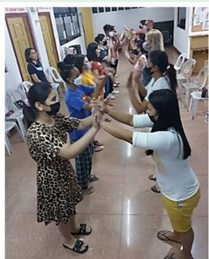
Beneficiaries enjoying the Team Building activities

"I had so much fun that time because I like the activities we do. I won a lot of candies as a prize, I'm happy to see everyone there. I enjoy doing teamwork with them and we get close to each other again." (Excerpt from the written report of a student beneficiary)