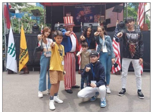
With Uncle Sam, kids pose with delight before the camera