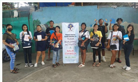
Bulacan based beneficiaries

"I had so much fun that time because I like the activities we do. I won a lot of candies as a prize, I'm happy to see everyone there. I enjoy doing teamwork with them and we get close to each other again." (Excerpt from the written report of a student beneficiary)