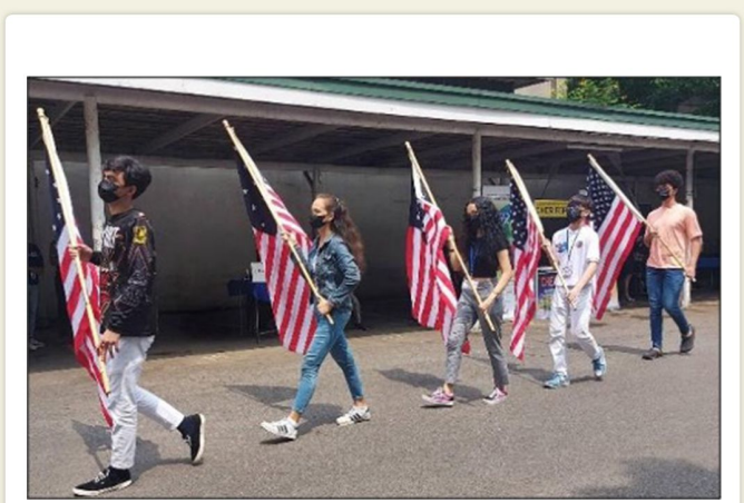
6 beneficiaries are American flag bearers during the parade

Participants were all delighted by the opportunity and experience of attending this activity.