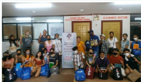
Angeles based beneficiaries

connected again with their fellow beneficiaries.