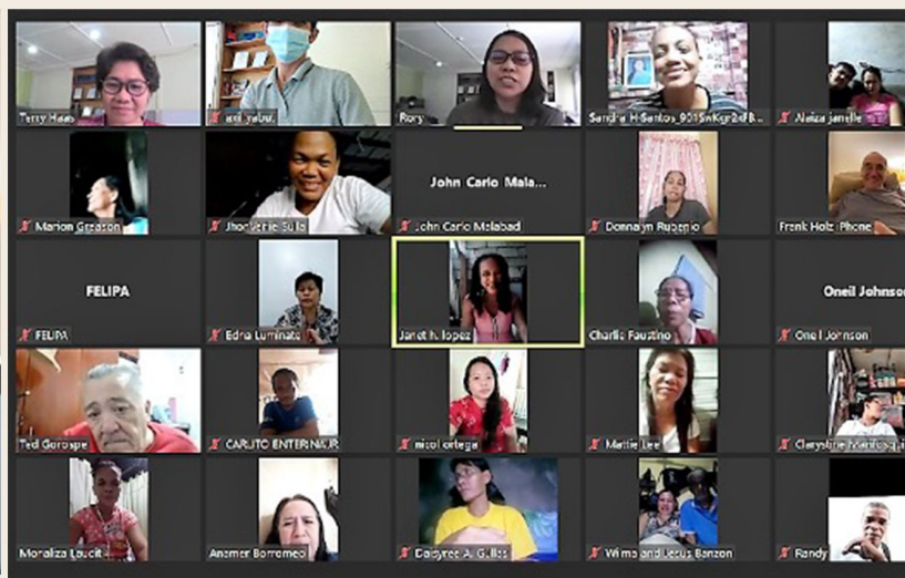
Parents actively participated and shared their issues and concerns on COVID 19