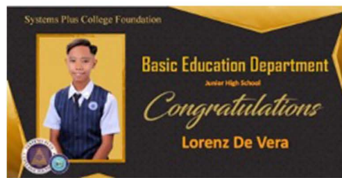
Lorenz De Vera Systems Plus College Foundation, Inc. Angeles City