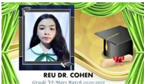
Reu DR. Cohen Gabaldon Elementary School, Nueva Ecija