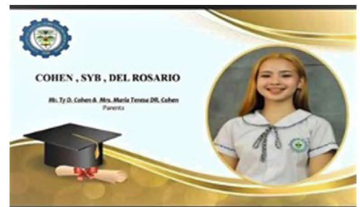
Syb DR. Cohen Gabaldon Vocational Agricultural High School, Nueva Ecija

Gordon Heights National High School, Olongapo City With High Honors