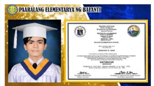
Jericho D. Bon Balanti Elementary School, Cainta, Rizal