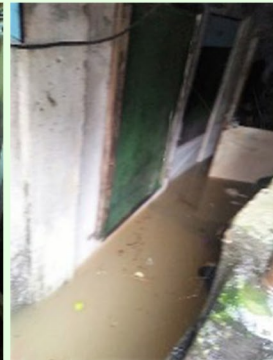
Flooded room of the Salingay family in Pasig City