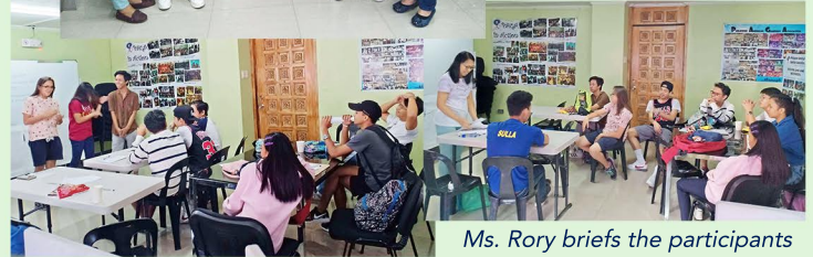
SHS Grade 12 sharing their experiences to Grade 11 members